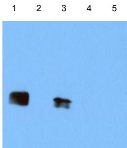
Figure 1. Western blot of purified Rac1, 2, 3, Cdc42 and platelet extracts probed with anti-Rac1 monoclonal antibody (Cat. # ARC03). The detection of 25 ng His-Rac1 (lane 1), His-Cdc42 (lane 2), 50 µg of platelet extract (lane 3), His-Rac2 (lane 4) and His-Rac1 (lane 5). ARC03 does not cross-react with Rac2, 3 or Cdc42. The blot was probed with a 1 µg/ml (1:500) dilution of ARC03, 30s exposure time.