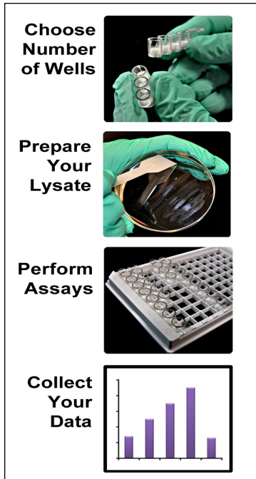
Figure 1: Simple and Quick Protocol