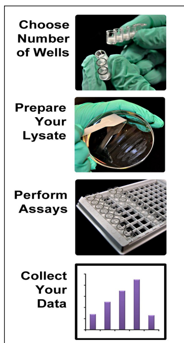
Figure 1: Simple and Quick Protocol