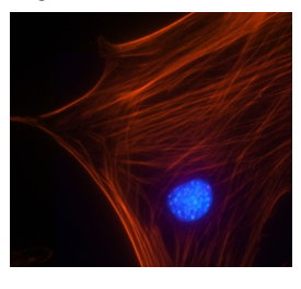
Figure 2: Actin Stress Fibers in a Swiss 3T3 cell

Legend: Swiss 3T3 cells were a grown to semiconfluencey on a glass coverslip and fixed and stained with Acti-stain™ 555 phalloidin and DAPI (nuclear stain as described in the method. Cells were observed under a fluorescent microscope equipped with a TRITC filter set 535EV/585Em filter set, a digital CCD camera and 100x objective. Note the abundance of actin stress fibers (red) stained throughout the cell.