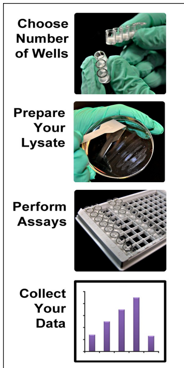
Figure 1: Simple and Quick Protocol